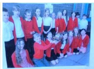
Glebeland School with a gift from Congo