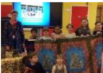
Assembly at St Benet's Primary School

We are very pleased that many schools are sponsoring a child at the School for Peace: St Benet's, St Edmund's, Langley, Somerleyton, Glebeland, St Mark's in Ipswich, and Wragby School in Lincolnshire. Thanks to all the wonderful fund-raising events that have gone on in the schools this year from coffee mornings to non-uniform days, we are able to keep more children at the school and contribute to the purchase of essential items and services.