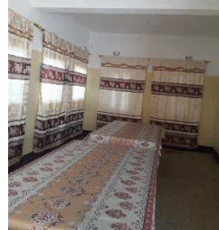
The completed interior

both inside and out. However there was not enough money to stock it and provide