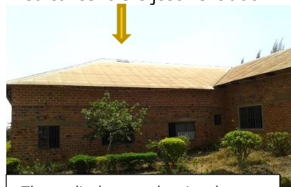
The medical centre showing the two solar panels under the arrow.

So far, there have been 18 deaths from Covid-19 in Kinshasa which has now been locked down to prevent the spread to other provinces. Although there are no known cases in Lubumbashi, the governor has taken several preventative measures, including shutting down schools, bars, restaurants and places of worship. Confinement only lasted two days as 98% of the population live from day to day and have neither money nor food to spare. The spread of the virus would be a disaster as the country has been struggling to deal with the world's worst measles outbreak. Since January 2019, 6,300 children have died from it. Malaria also hit the people badly last year. Fortunately all of the children at the school have been vaccinated against measles and as soon as there are any signs of malaria, the medical centre is just next door