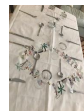
A table set with a Congolese hand-embroidered cloth

their headteacher and her husband drove to the Arctic to raise money. On 15 th February we celebrated St Faustino's day at the Old Rectory in