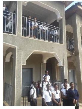
The completed exterior with the staffroom above